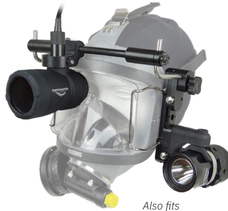
Also fits commercial helmets